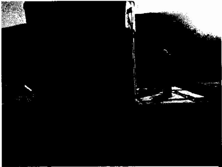
Diagram #3 Leachate Tank

POTENTIAL LOCATION OF LEACHATE TANK VERIFICATION TAG